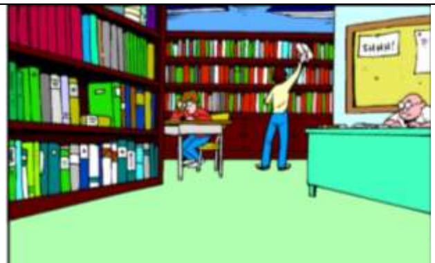
2.- LIBRARY /laibri/