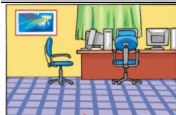
5.- COMPUTER ROOM /kompiuter rum/