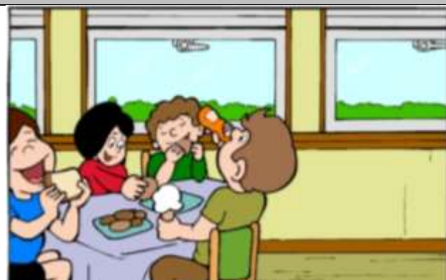
4.- DINNER ROOM /diner rum/