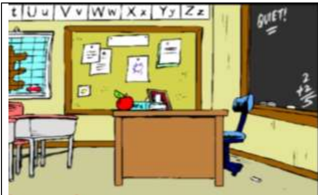
1.- CLASSROOM /klasrum/

I.- PRACTISE YOUR VOCABULARY, you can practise your pronunciation using the words between slashes. (Practica tu vocabulario. Puedes practicar tu pronunciación usando las palabras entre barras)